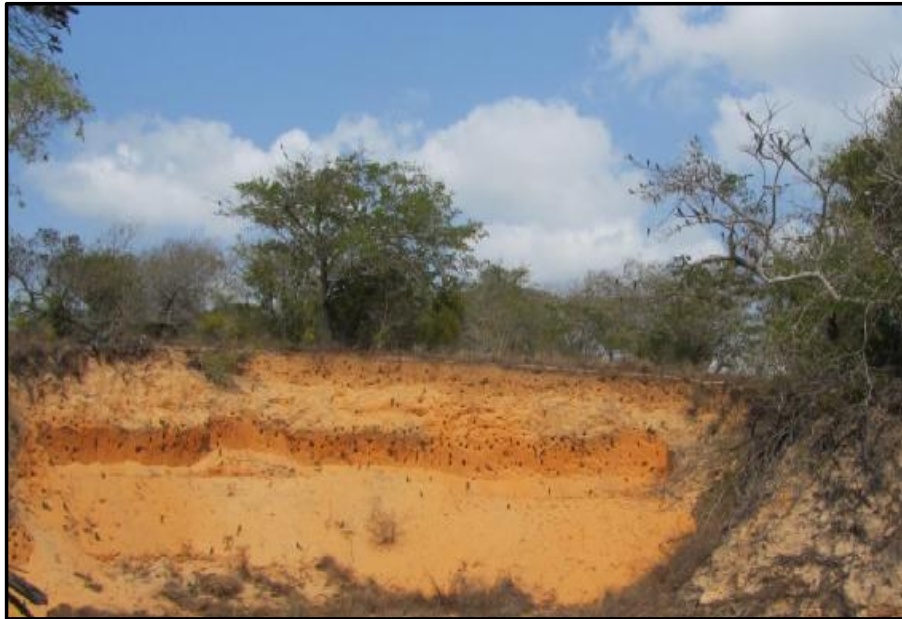
Fig 5 – Active Olive-Bee-eater colony in a sandy embankment.