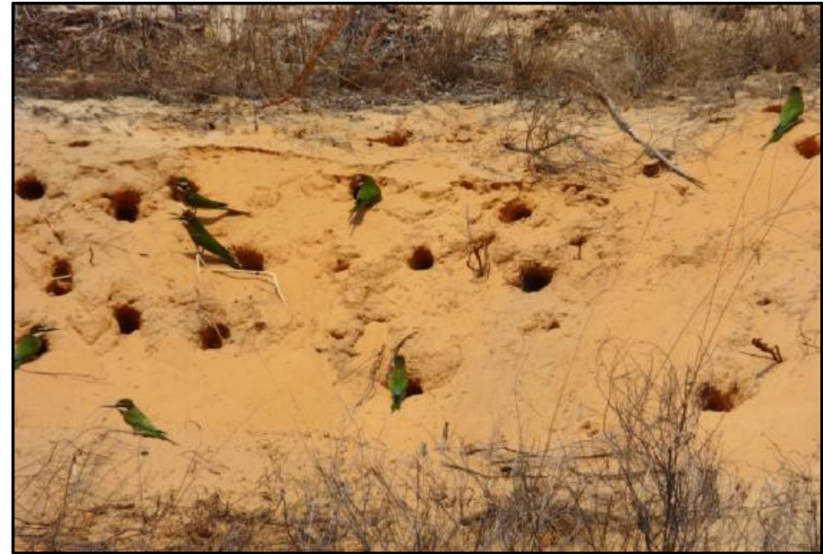
Fig 6 – Olive Bee-eaters at nest burrows.

ecological phenomenon on the peninsula. Such a view gains support from the observations by Robson and Horner (2012) on the Ozabeni coastal plain just north of Lake St Lucia, KwaZulu-Natal (approximately S27°40', E32°34'). Following extremely heavy rainfalls after Cyclone Domoina in late January 1984, many pans and wetlands in that area were inundated. Robson and Horner (2012: 91) noted that "[t]he extent of flooding was far in excess of anything in recent times. The study period [1985-1995] was characterized by a gradual drying out of the coastal plain ... [t]his was reflected by the large and widespread populations of both grassland and aquatic birds present in the early years gradually declining. Cyclonic flooding is recognised as an occasional phenomenon, and Domoina undoubtedly had a dramatic short-term beneficial effect to birds on the coastal plain by providing an increase in aquatic habitat, an influx of nutrients and