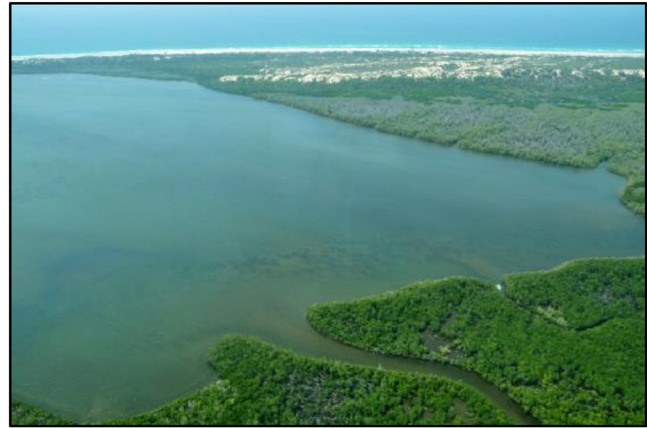
Fig 1 - Southern part of Inhambane Estuary, Vilanculos Coastal Wildlife Sanctuary, San Sebastian Peninsula, with Indian Ocean in distance.

The predominant vegetation in the Sanctuary is low Brachystegia spiciformis (miombo) savanna growing on white, nutrient-poor sands.